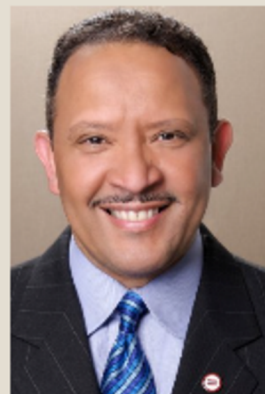
Marc Morial PRESIDENT AND CEO NATIONAL URBAN LEAGUE