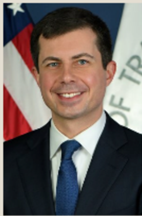
Pete Buttigieg U.S. SECRETARY OF TRANSPORTATION