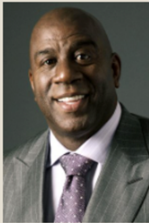
Earvin "Magic" Johnson

PRESIDENT AND CEO NATIONAL CENTER FOR AMERICAN INDIAN ENTERPRISE