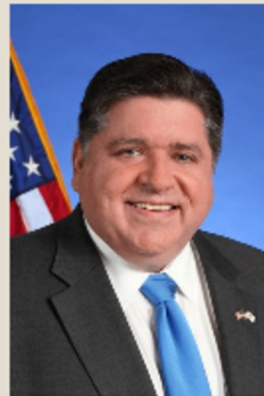
J.B. Pritzker GOVERNOR OF ILLINOIS