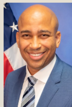
Miguel Esti3n ACTING NATIONAL DIRECTOR DEPARTMENT OF COMMERCE, MINORITY BUSINESS DEVELOPMENT AGENCY