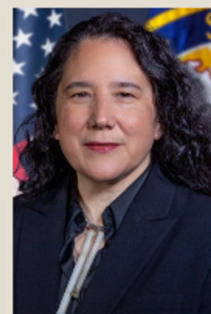
Isabella Casillas Guzman ADMINISTRATOR U.S. SMALL BUSINESS ADMINISTRATION