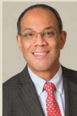
John W. Rogers, Jr. CHAIRMAN AND CO-CEO ARIEL INVESTMENTS