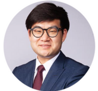
Sam Cho Commissioner Port of Seattle