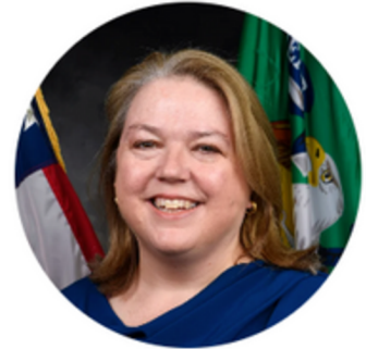
Laurel Blatchford Chief Implementation Officer, IRA United States Department of the Treasury