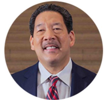
Bruce Harrell Mayor Seattle